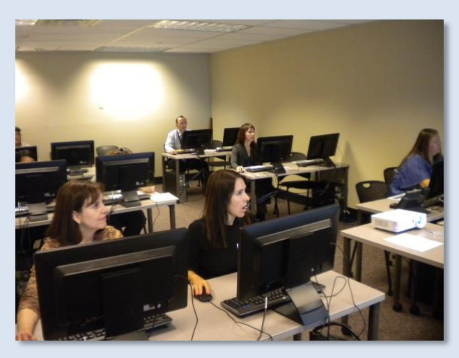
SMEs at an Advantage Navigation training session